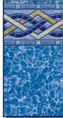
U Bead Brighton Prism Liner